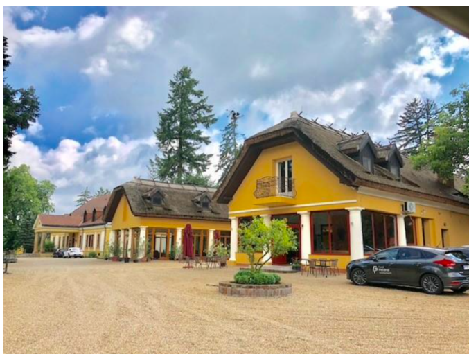
GOLF CLUB HOUSE